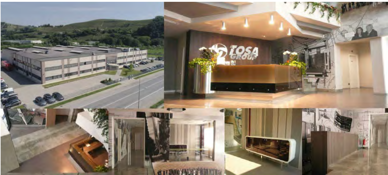
Internal and external view of the headquarters in Santo Stefano Belbo

Since 2011 Tosa Group's headquarter is in Santo Stefano Belbo (Cuneo province). The building was designed aiming at energy saving and efficiency as well. These are the same criteria applied in the machine construction, both in terms of easy accessibility, user-friendliness, comfort: from skylights to heated floors, from the use of bore water together with water from the aqueduct, from a high energy efficiency class to the human design of rooms aimed at maximising the experience of the team, everything has been considered in view of environmental and corporate sustainability.