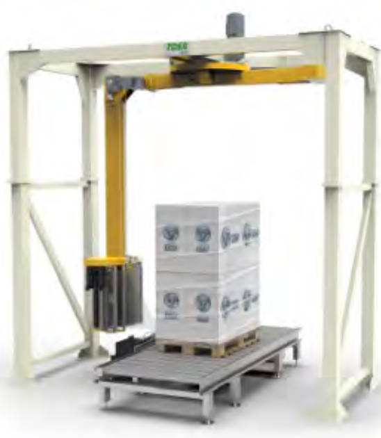
Types of machines made by Tosa. From left: with rotating platform, rotating arm. Above: rotating ring.