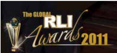
'Best Future Project' - Cleopatra Mall