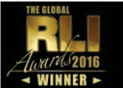
'Best Future Project 2016'

Signs of the Times Award for Electric Sign Design - Galtier Plaza