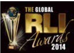
'Designer of the Year 2014'